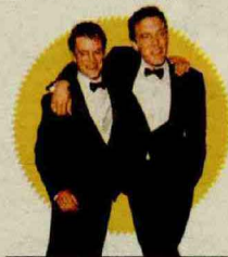
Damon and Affleck in 1998

A: "It was a lot like writing with Ben, actually," says Damon, 42, who won a screenplay Oscar in 1998 for Good Will Hunting .