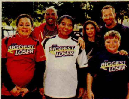
The Biggest Loser contestants and their trainers

A: In an effort to take the focus away from numbers on a scale, the three kids (ages 13 to 16) joining the 15 adult contestants this season will not be weighed on camera or be eligible for elimination. "It's about making fitness and health fun and building self-esteem," says trainer Jillian Michaels, 38, who returns to the weight-loss show (NBC, Mondays) after a two-season hiatus. "I was surprised by how courageous the kids were," she adds. "I hope it's a wake-up call to parents that they need to lead by example, and I hope other children are motivated and inspired."